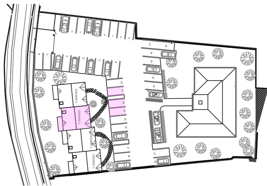
Pavillon N° 3 - 5 pièces